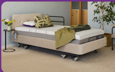
CurveX® independent Bed Corner Code: ICCX

To order your upgraded bed to CurveX® Bed Corners, this will need to be specified at time of order placement.