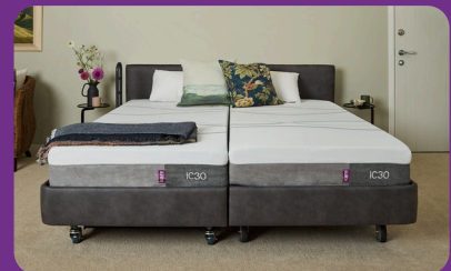
CurveX® Partner Set-up Bed Corner Code: PSCX